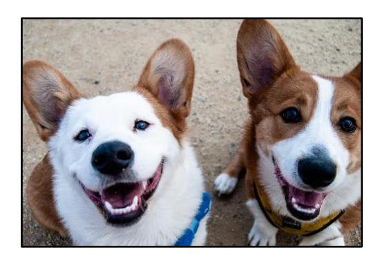
Consider adopting a pet.

Play online games with friends and loved ones.