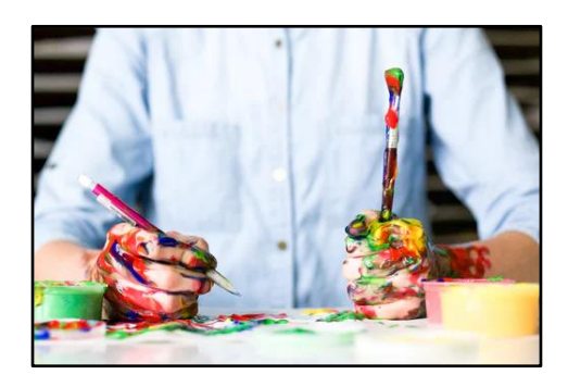
Take an online class and learn something new.

It can feel intimidating to take your first steps toward becoming more connected. Here are some simple actions you can take to get connected.