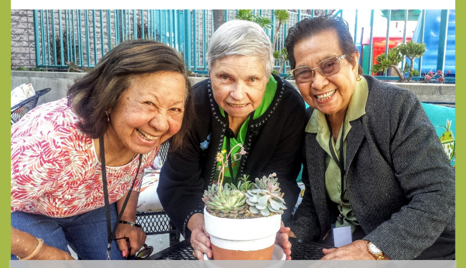
Day Center participants plant and maintain their own urban garden.

Nature is therapeutic. Gardening and planting can have a positive impact on the well being of individuals, including those living with dementias and other disabilities.