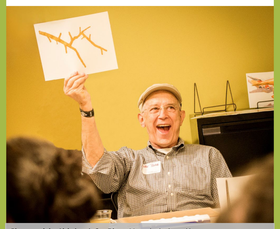
Memories in the making.

Art projects can create a sense of accomplishment and purpose. They can provide the person with dementia and caregivers an opportunity for self-expression.