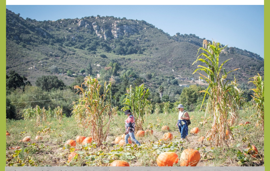
Connections outing.

Social engagement is a key component in maintaining a good quality of life. People in the early stages of Alzheimer's disease or related dementia may still enjoy going out to places they enjoyed in the past like a favorite park, restaurant, museum, or just having family and friends visit them.